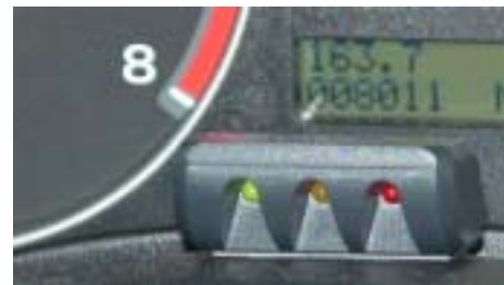
In-Vehicle Feedback provides continuous driver feedback via an indicator with a "Green, Yellow, Red" overall safety indicator.

The GreenRoad Safety Center system combines in-vehicle technology with integrated web applications for an advanced approach that continuously rates driving skills and safety levels, trains drivers in real time by providing feedback as they drive, and helps maintain the change through continuous reinforcement. Sensors installed in the vehicle collect information that analyzes driver skill and detects maneuvers the driver performs such as braking, accelerating, lane changing, passing, cornering, swerving, speed and much more. A simple "green, yellow, red" display in the vehicle alerts the driver about their current and ongoing safety status, and a tone can be set to alert the driver that their driving is unsafe.